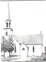
In 1888; Window Added In 1913