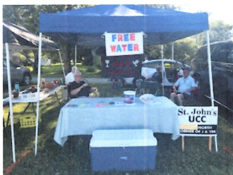
Holgate "Eyes to the Skies" June 28, 2025

Birthday Cards with a gift card will be handed out to the children at church. Enjoy!