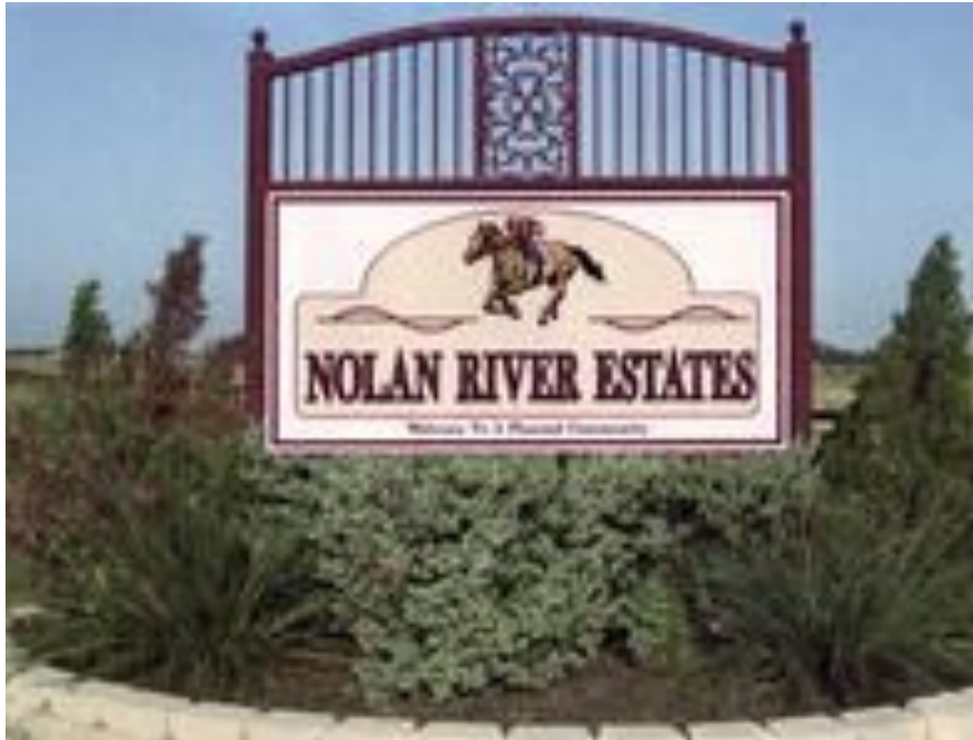
Our NRE Sign on S. Nolan River Road as seen from the North entrance to our subdivision.