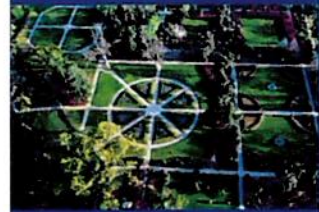
Visit Middleton Place and Gardens