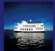
Cruise Around Charleston Harbor