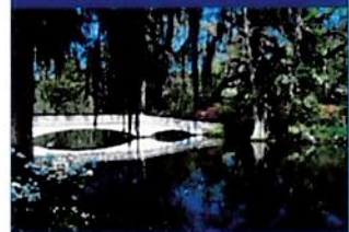
Take in the Picturesque Views of Charleston

Day 6: Today, after enjoying a Continental Breakfast, you will depart for home... a perfect time to chat with your friends about all the fun things you've done, the great sights you've seen, and where your next group trip will take you!