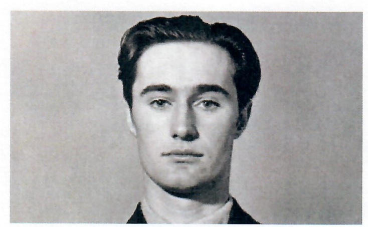
Operation Gunnerside was not the end of Joachim Rønneberg's wartime exploits. He went on to blow up a railway bridge with plastic explosives and disrupt supply lines.

In mid-evening the commandos set out, carrying five tommy guns, grenades, compasses, shears, explosives, fuses – and cyanide pills. When they were halfway down they first glimpsed the seven-floor Norsk Hydro. They crossed the river and by 11.30pm, having scaled the heights, they were awaiting the change of guards.