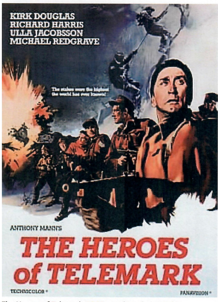
The Heroes of Telemark, 1965, was based on Joachim Rønneberg's daring raid.

Four Norwegian commandos had been sent in as an advance party on 18 October 1942, as part of Operation Grouse. The British followed this on 19 November with 34 glider-borne demolition experts. In appalling conditions the gliders crashed, and the 14 survivors were promptly executed by the Germans.