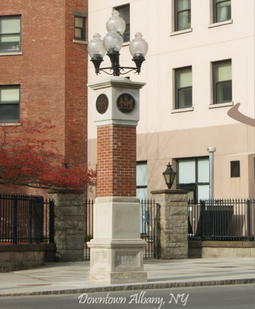
Downtown Albany, NY