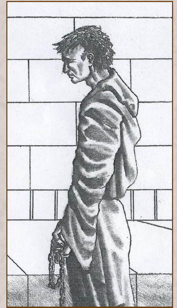
Paul the Apostle suffered great torment to pave the way for the world to give the gospel (he is shown in cuffs here before King Agrippa). The gospel is for everyone and no other religious or philosophical belief is an excuse not to get saved.

When Paul wrote the book of Romans he had taken missionary journeys through Asia, and he had given the gospel to many people. No matter what reason a man had for refusing to get saved at Paul's plea, even if he said he would do it some other time, it did not make him guiltless before God after he died. ■