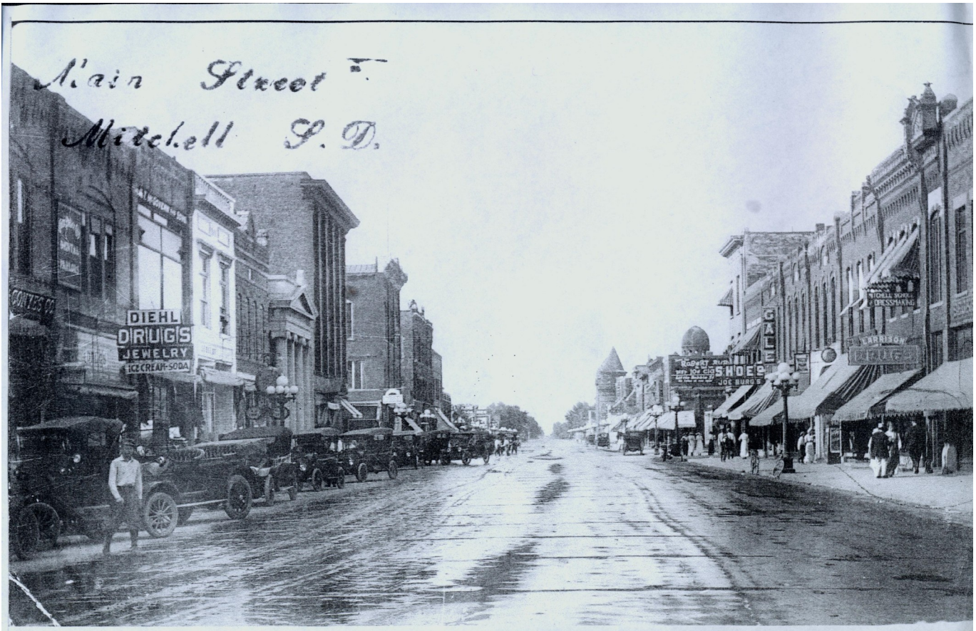
Looking north from the 200 block of Mitchell's Main Street.