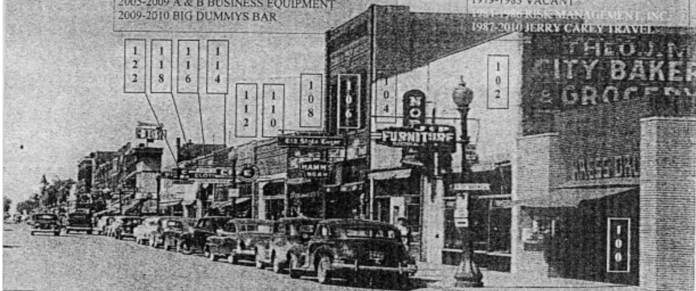
AVENUE, MITCHELL, S.D., DAK.

106 1950-1968 EAGLE BAR 1969-1975 THE GALLERY TAVERN 1976 CHAPARRAL CLUB TAVERN 1977 VACANT 1978 INTRA STATE INSULATION 1979-1983 VACANT 1984-1986 MUSIC MANAGEMENT, INC. 1987-2010 JERRY CARLY TRAVEL