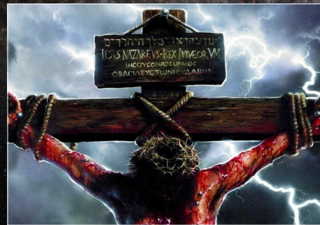
JESUS, THE PIERCED ONE