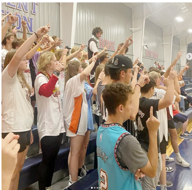
The ACS Student Section cheers on the volleyball team.