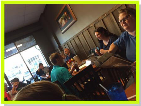
AIR HEAD AWARD