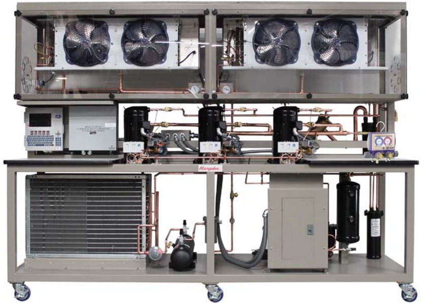
MODEL H-CRT-4B Commercial Multi-Compressor Rack Refrigeration System Trainer with Emerson Controls and with Electrical Fault Package