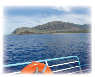
Best Location for Dolphins