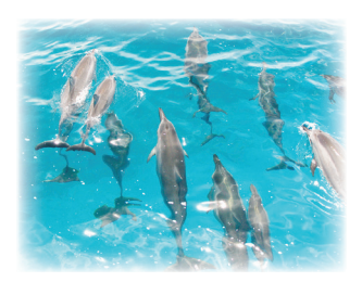
Average 70 Dolphins Daily