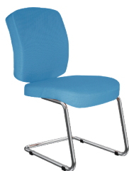
VI-L-2 A : 19 1/2 " C : 18" E : 18"