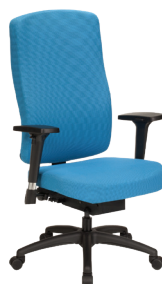
VI-D A : 19 1/2 " C : 17" - 22" E : 26"