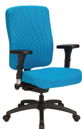
VI-H A : 19 1/2 " C : 17" - 22" E : 22"