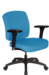
VI-L A : 19 1/2 " C : 17" - 22" E : 18"