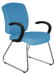
VI-L-3 A : 19 1/2 " C : 18" E : 18"