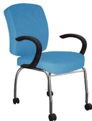
VI-L-4 A : 19 1/2 " C : 18" E : 18"