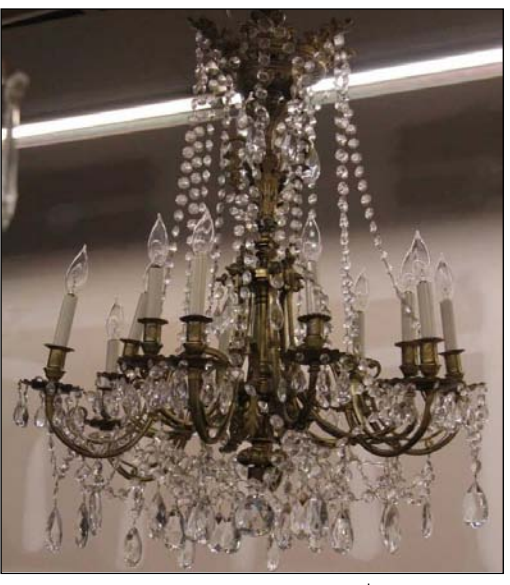
A French chandelier earned $2,250.