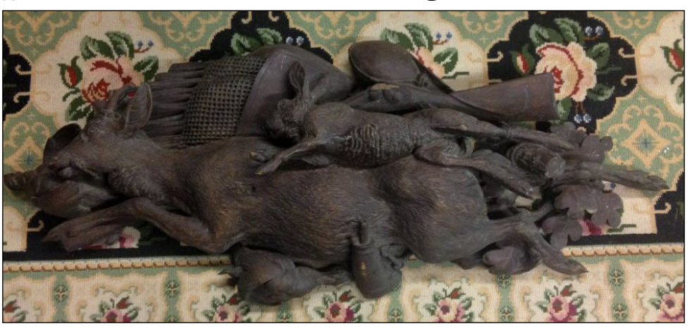
This German Black Forest wall plaque sold for $2,000.