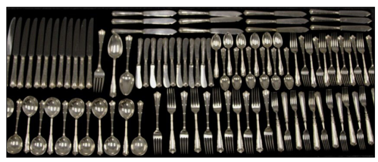
A flatware service brought $2,250.

with the same family for more than 80 years, also performed well, with brooches selling for $2,000 and $2,250, as well as a