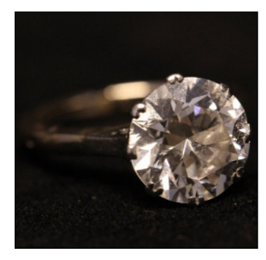
The top lot of the auction was a 3½-carat single stone, old European cut diamond set in a platinum band, which attained $62,000.