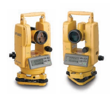
DT-200/DT-200L Series Digital Theodolite