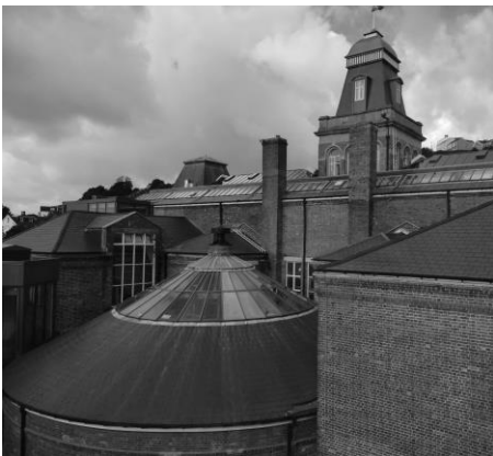
View from my dorm room in Swansea.