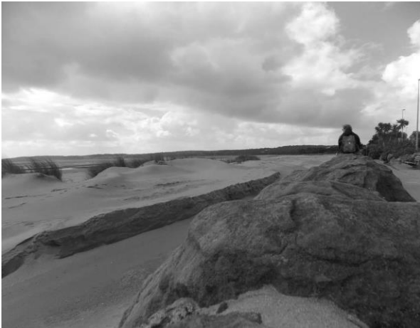
First time seeing Swansea Beach.

the 1100's. We walked all through Singleton park, where there were gorgeous botanical gardens we basically had to ourselves. At a walk around campus with the international students, we wouldn't know it but we had met who would become some of our best friends in Swansea for the next three months.