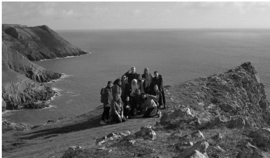
A big group of us went to Three Cliffs Bay together.

It's strange how looking back I don't have one single favorite memory, but a general overwhelming fondness for Wales and the people I met there. The experience is hard to put into words but it's one I will cherish forever. I want to thank The Welsh Society of Central Ohio for the generous scholarship making it possible for me to have this opportunity. I have never felt more myself than when I was in Wales, and I know many people have had this same feeling. I am extremely thankful that I was able to be somewhere that makes goodbye's so hard. A part of me will always be with Cymru!