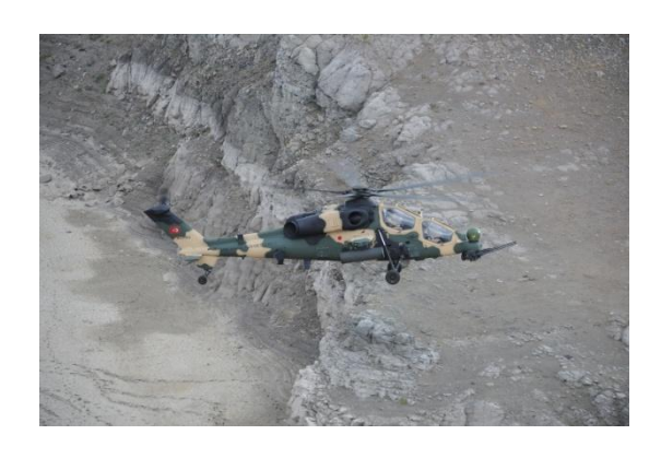
Turkish attack helicopter T-129

details about it". (www.aa.com.tr, www.janes.com)