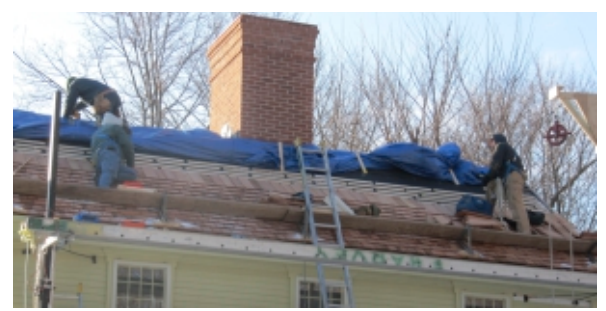
Talented craftsmen brave the cold temperatures to install the Certi-label™ roof

Certi-label™ cedar fragrance filled his warehouse, right through to the end of a highly detailed installation program.