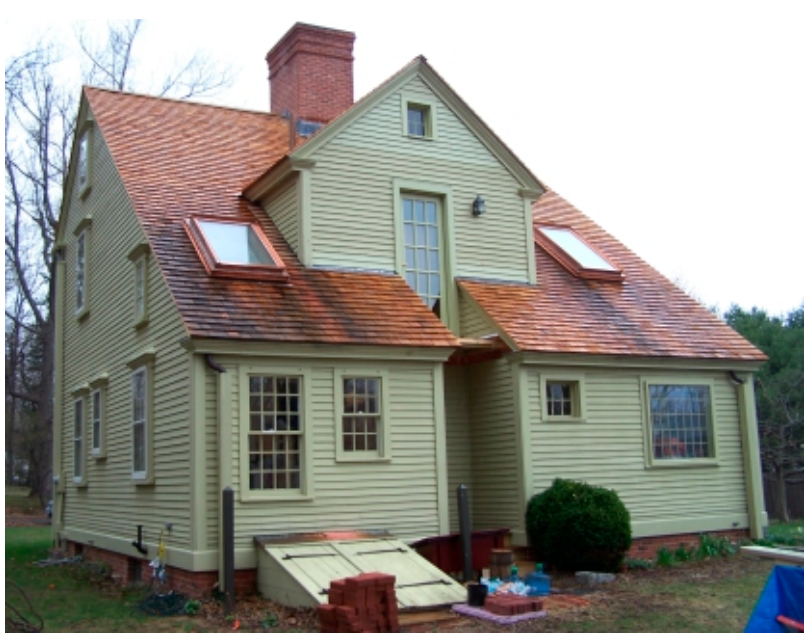
View from the backyard

The homeowners readily admit this project consumed far more time than they initially expected. However, they have a beautiful home that is true to American history and the Georgian saltbox style they adore. Their home also garners compliments every day. And people aren't just saying nice house ... everyone who looks says it's beautiful.