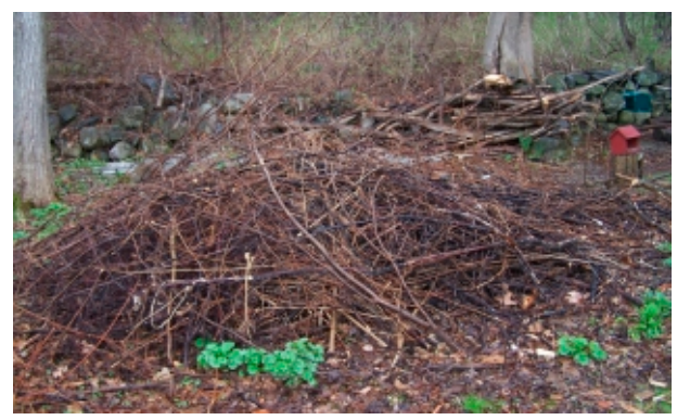
An outdoor brush pile provides refuge for small birds and chipmunks