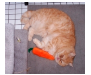
Zoe the cat

When the entire on site crew retreated inside from the drizzling rain to view project drawings, a couple of