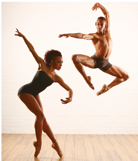
The Geffen Playhouse www.geffenplayhouse.com

America's Composer" August 4 - August 16, 2015 Critic's Choice! Hershey Felder brings to life the remarkable story of Irving Berlin. From the depths of anti-Semitism in Czarist Russia, to New York's Lower East Side, and the world, Berlin's story epitomizes the American dream. It's an unforgettable journey.