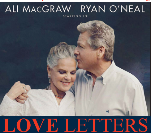
LOVE LETTERS with Ali MacGraw and Ryan O'Neal October 13 - October 25, 2015.