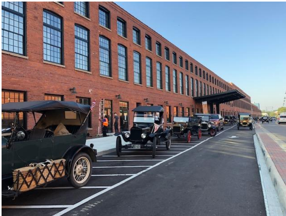
Model T's parked alongside the hotel, which used to be a paper mill.