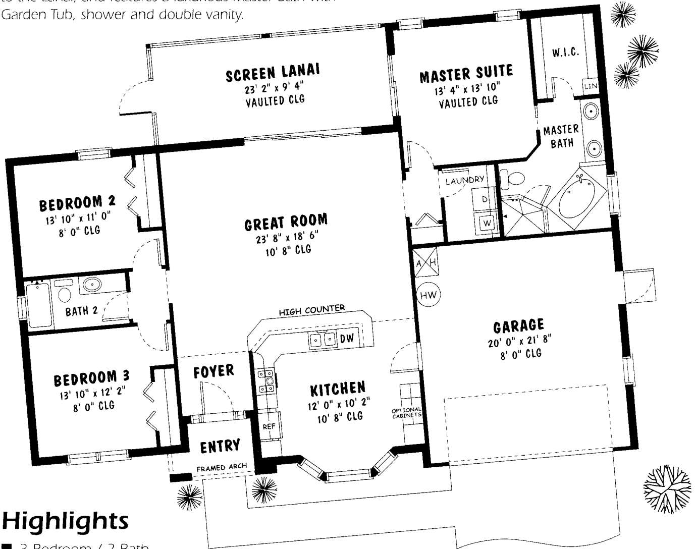
Floorplan Shown in Block Version

The Windsor II, with its open raised entryway, is stately and classic. The living areas allow the flexibility to design your own sitting and dining areas. A spacious Kitchen offers plenty of room for a table setting near the windows. You'll find a Breakfast Bar that opens to the Great Room and expansive Screened Lanai. The Master Suite also opens to the Lanai, and features a luxurious Master Bath with Garden Tub, shower and double vanity.