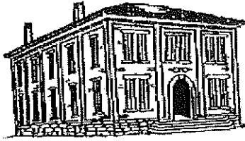
CLINTON TOWNSHIP HALL CIRCA 1939