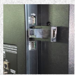
Plugs Directly into TV's HDMI Port