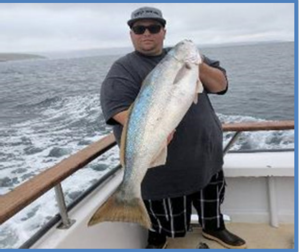
Coastal Conservation Association of California