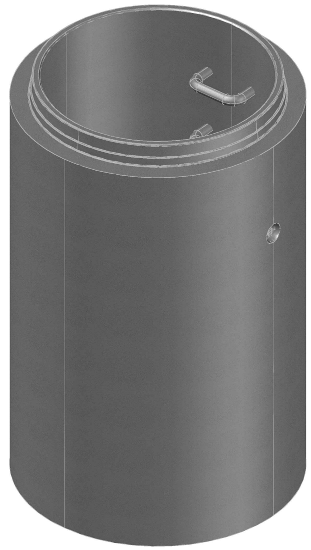
ISOMETRIC VIEW NTS