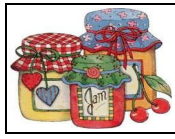
Exhibit Hall Department E Club and Commercial