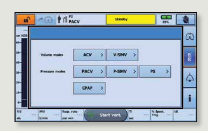
A full suite of modes offer versatile therapy options as the patient's condition progresses.

Real-time waveforms and patient information are displayed on the large colour touch screen to ensure correct set-up and to track patient condition. FiO<sub>2</sub> and SpO<sub>2</sub> are integrated to complete the therapy picture.