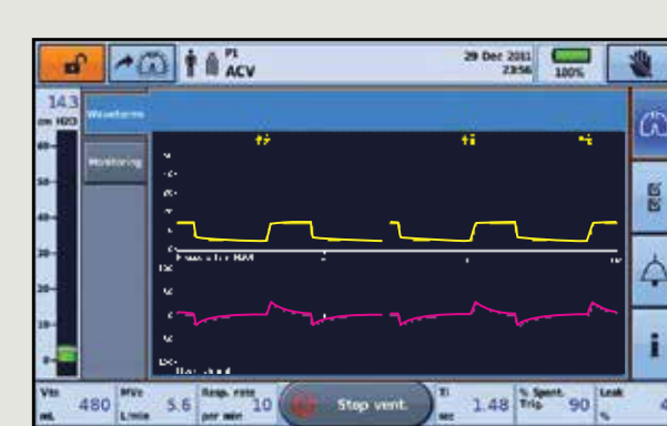
Real-time pressure and flow waveforms display essential therapy parameters on the large touch screen.