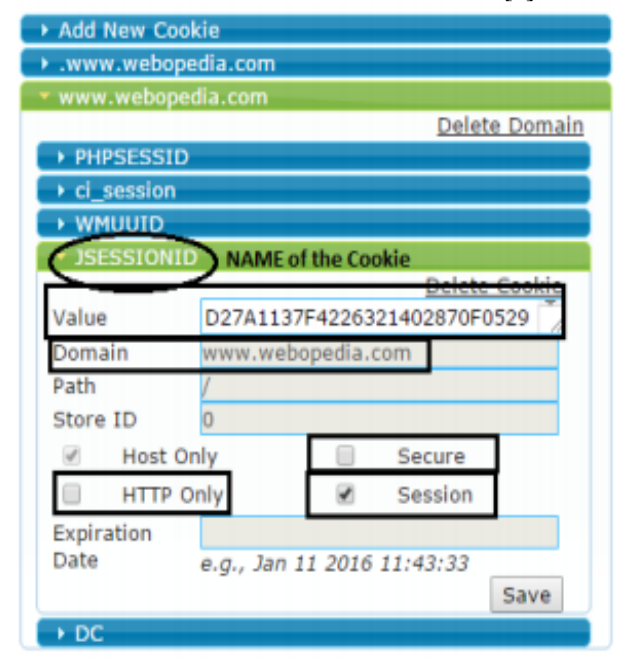
Fig.1: Attributes of cookies