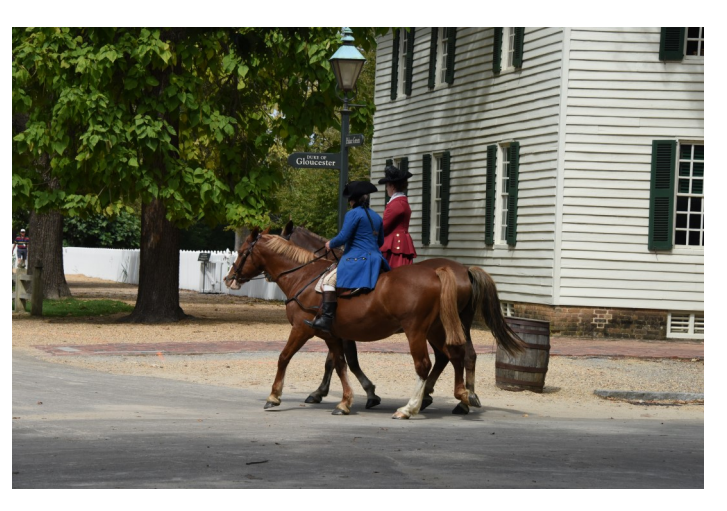
A gentleman and his lady take a ride through the streets in the glorious Indian Summer weather.