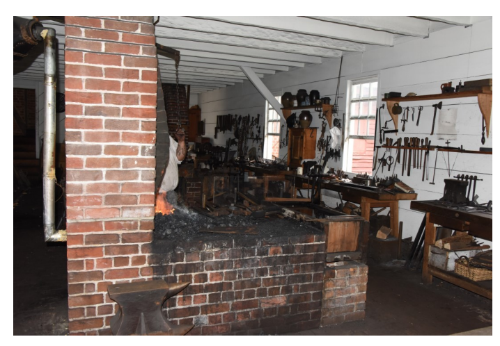
The Blacksmith shop—one of the many "firefox" type displays where the enactors really do what they did in 1770 and stick to their roles.