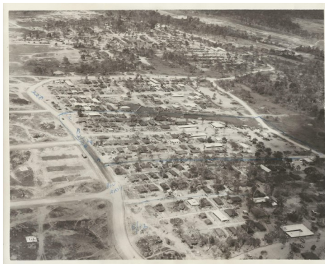
An Khe and the Golf Course. It was nice but the bulk of us never saw it or lived there.

In the final phase of testing, "A" Battery was joined by two additional Aerial Rocket Artillery Batteries and a Headquarters Battery to form the initial Aerial Rocket Artillery Battalion in the United States Army, and was designated as the 3<sup>rd</sup> Battalion (Aerial Rocket), 377th Artillery on 30 April 1964.