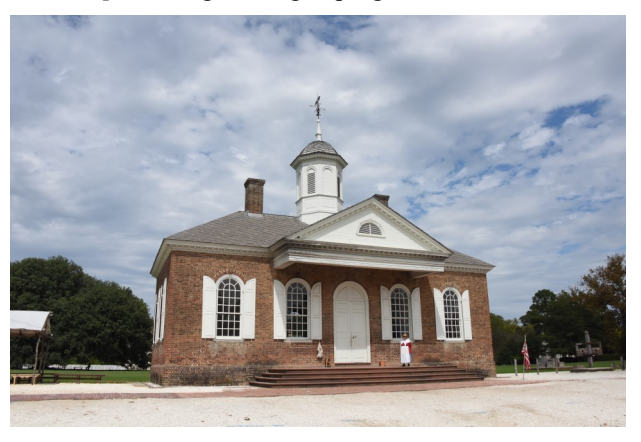
The Court House in Old Williamsburg. Look at that