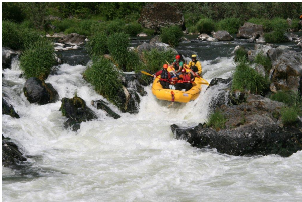
Middle Chute of Rainey Falls