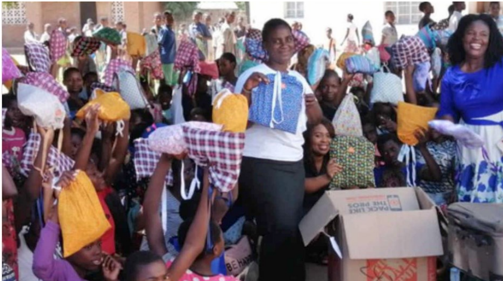
This photo illustrates the joy the kits bring to Malawian women and girls.