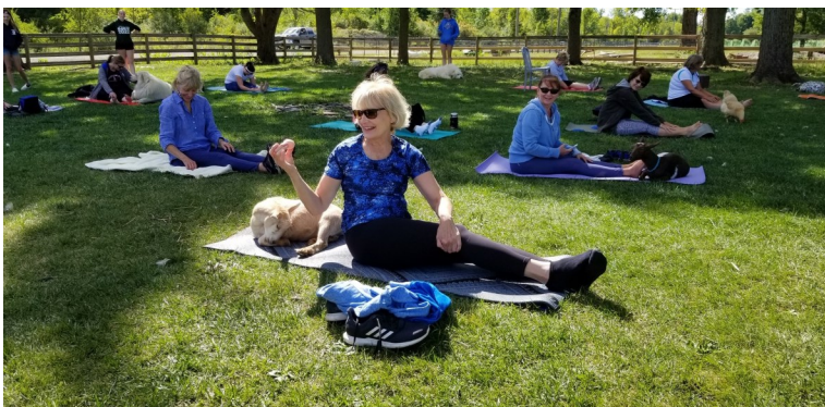
SIGP Co-president holds up the special gift a hen laid on her yoga mat.