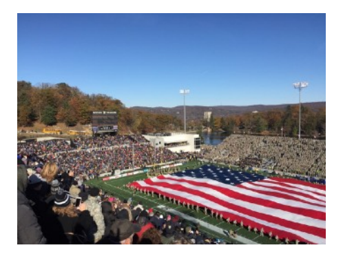
OPENING CEREMONY FROM OUR TRIP IN 2017

A Troop 78 tradition returns as we head back to the United States Military Academy, a/k/a "West Point," to camp, tour the campus and see the Army Black Knights take on the University of Connecticut in football at historic Michie Stadium on the Hudson River.