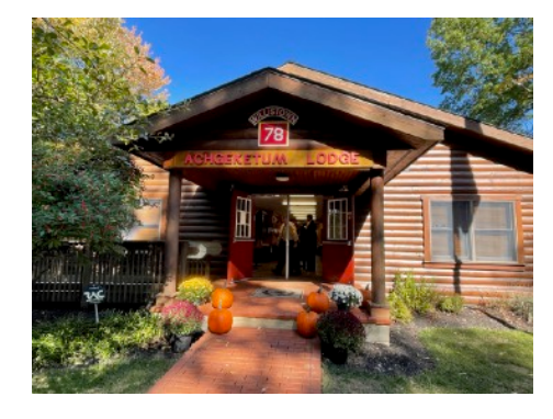
EAGLE SCOUT SHREYAS SAO