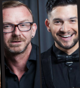
CIC Beauty Team