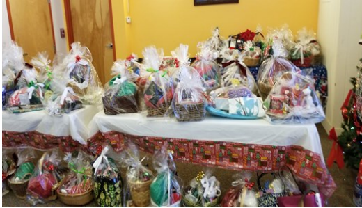
Baskets prepared in 2018

Wednesday, December 4 from 7:00 – 8:30 p.m.