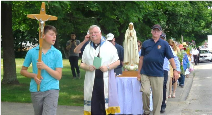
Last Month's Procession thru Gorham Over 84 Participants joined in the Procession and Rosary Rally!

Thank you for attending our first two of 6 public rosary rallies here at St. Annes and our Very First Procession through the town of Gorham! Join us on Saturday, July 14 th at 12:00pm as we celebrate the 3rd apparition of Our Blessed Mother in Fatima Portugal 101 years ago.