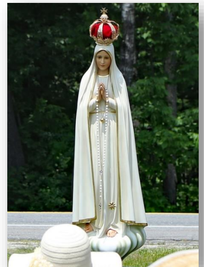
Our very own Lady of Fatima Statue

Volunteer with us. We need your help setting up, teaching others how to pray the rosary, providing support, and just to be there with your smile. Everyone is welcome. Non-Catholics, people who have never prayed the rosary – every one of Gods children. For those who cannot attend, we will live stream the event!