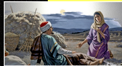
Boaz and Ruth at end of Wheat Harvest