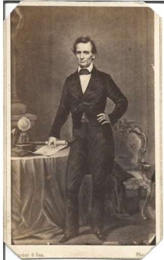
Abraham Lincoln (1809-1865)

By the time the 30 th Congress convenes on December 6, 1847 for its first session, the South has assembled a roster of outspoken pro-slavery Senators who are determined to defeat the Wilmot Proviso and restore unity to the Democrat Party.