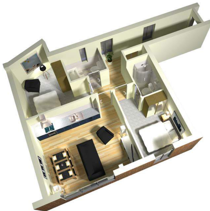
Example floor plan 2 Bed apartment