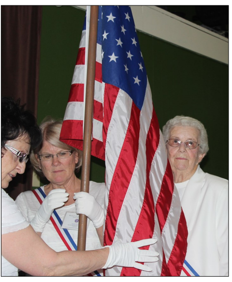
Photos taken at the NO COA 48th Bi-Annual State Convention in Medora

PEACE AND UNITY TO ALL THE CATHOLIC DUAGHTERS.