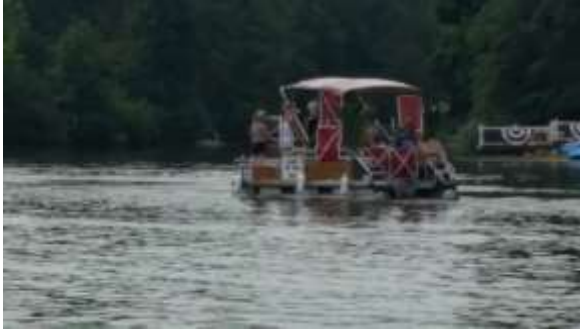
The Anderson's always decorate nicely