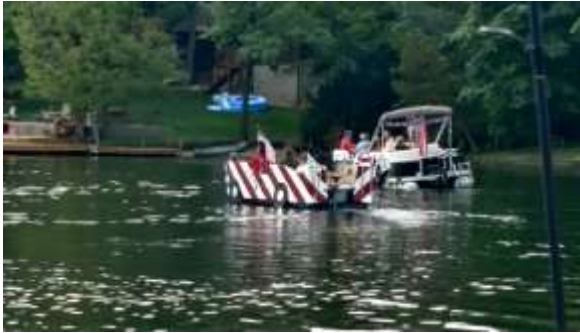
Winning entry "Barn in the USA"!