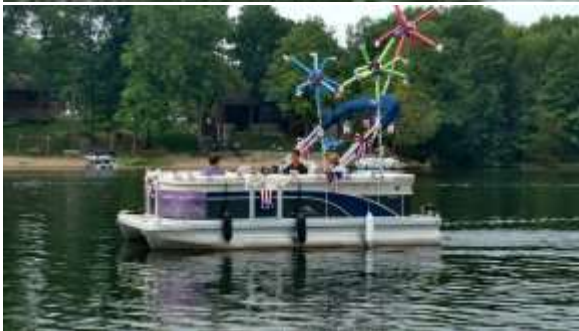
Boats were stacked up at the Judge's dock