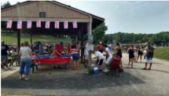
Winner's Circle! Category Winners Pose