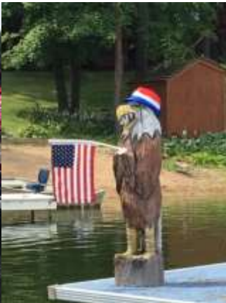
Judge's stand Eagle pride!