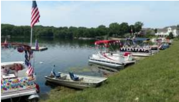
Winning entry – Race Car on the Water