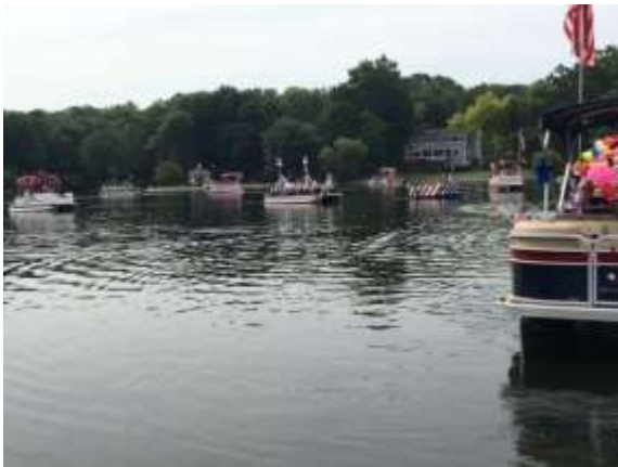
Another parade line shot from the front