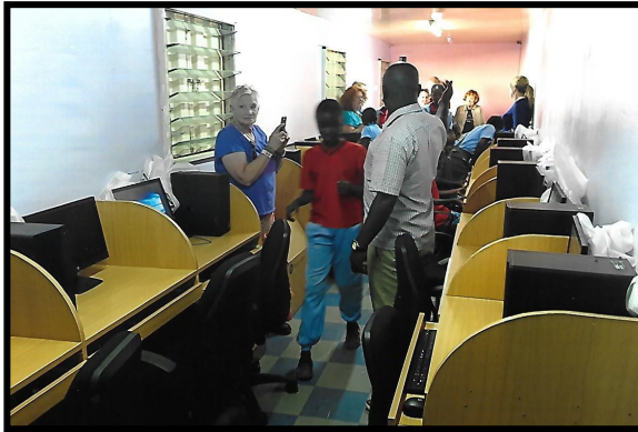
This is the brand new computer lab on the Huruma MCDC Campus that we got to open and dedicate. Thank you partners for making this special project come true. Now there are secure computer labs on both MCDC campuses with 15 desktops in each one.