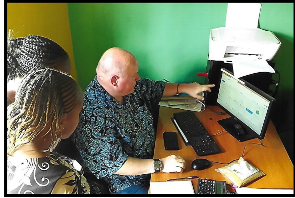
Troy then created a new account in the "cloud" for the excel reports. Now for the first time, authorized people on both sides of the globe can access these reports and data 24/7.