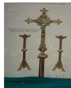
From St John's website s and 150 anniversary book