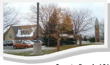
County Roads 101 and 10.