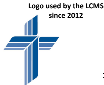
Logo used by the LCMS since 2012