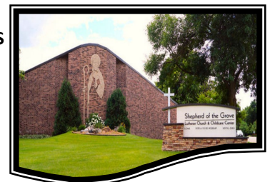
11875 West Eagle Lake Drive Maple Grove, MN 55369

The Missouri Synod, is a traditional, confessional Lutheran denomination in the United States. Confessional Lutheranism is a name used by Lutherans to designate those who accept the doctrines taught in the Book of Concord of 1580 (the Lutheran confessional documents) in their entirety because they are completely faithful to the teachings of the Bible.