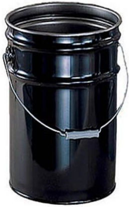
A five gallon steel pail similar to the exploding pot, handle and all, that we used during the nights while we lived in Hamel.

To some this incident is etched in their brain, to others only a myth. Either/or I'm thinking this memory may bring a smile to your face.