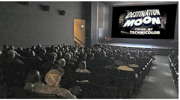
Museum of Flight - August 2019