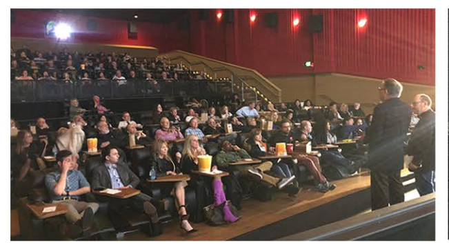
Newport Beach Film Festival - May 2018