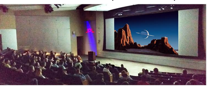
Jet Propulsion Laboratory - June 2019