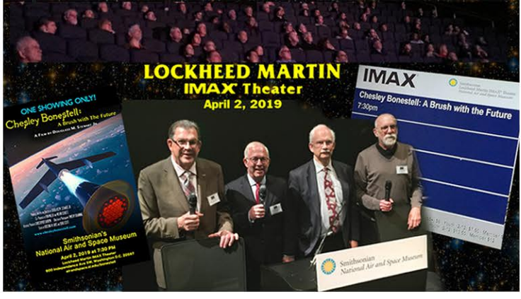
Smithsonian National Air and Space Museum - April 2019