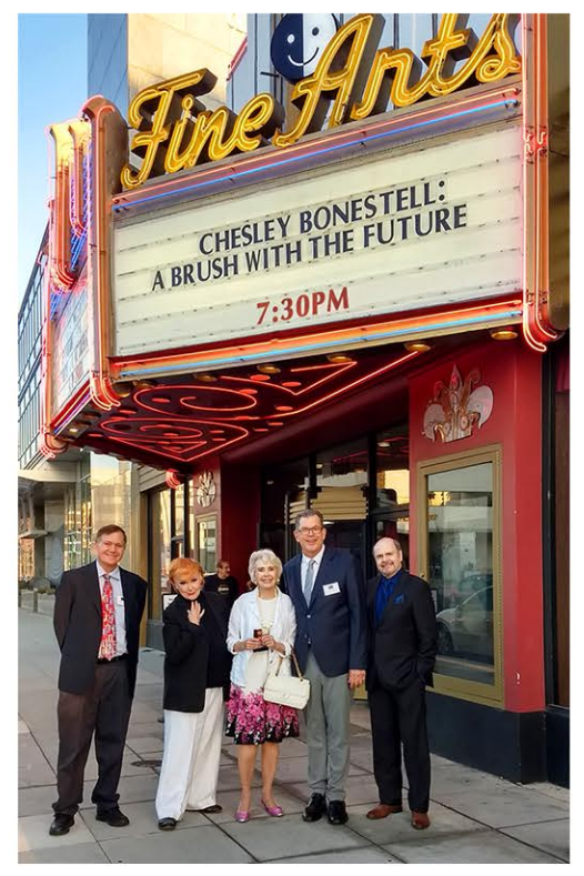
Ahrya Fine Arts Theatre - August 2019