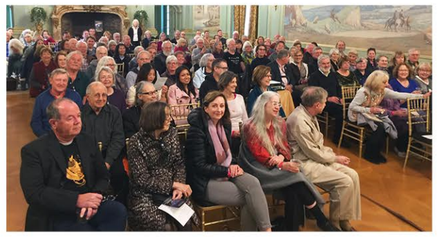
Filoli Historic Trust - March 2019