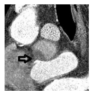
Figure (2a). Computed tomography, sagittal view of the partial thrombosis of the ascending aortic pseudoaneurysm (arrow).