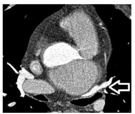
Figure (3b). Computed tomography, long-axis view of partial compression of the left superior pulmonary vein by the ascending aortic pseudoaneurysm (arrow).