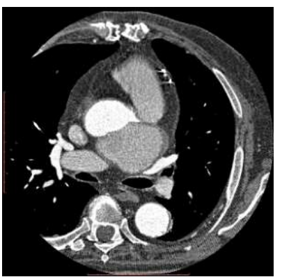
Figure (1a). Computed tomography, a short-axis view of the ascending aortic pseudoaneurysm. Asc Ao: ascending aorta, AoR: Aortic Root, Des Ao: descending aorta, RCA: Right Coronary artery, RPA: right pulmonary artery.