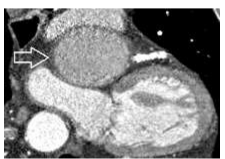
Figure (2b). Computed tomography, sagittal view of the maximum diameter of the ascending aortic pseudoaneurysm (7.5 cm).