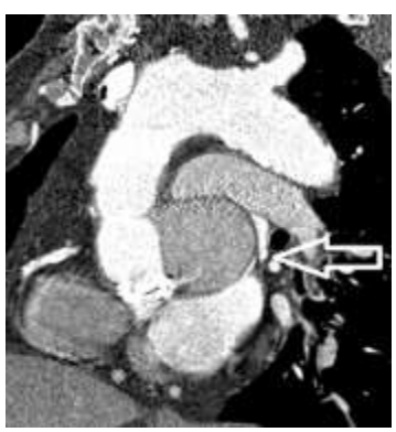
Figure (1b). Computed tomography, long-axis view of the large ascending aortic pseudoaneurysm locating on the posterior side of the aorta. Asc Ao: ascending aorta, LV: left ventricle, RV: right ventricle, RPA: right pulmonary artery, AVS a trioventricular sulcus.