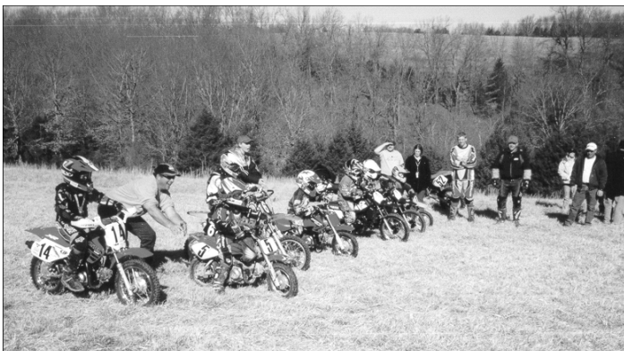
The Pee Wee class takes off.