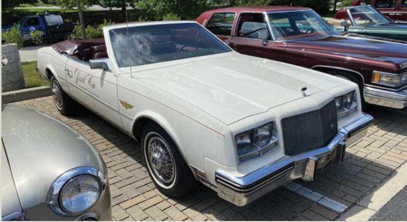
1983 Buick Riviera