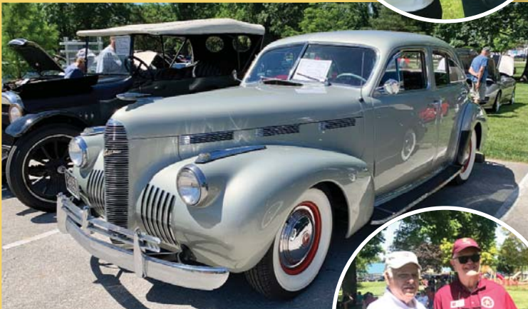
Warner Young – Outstanding – '40 LaSalle Series 52