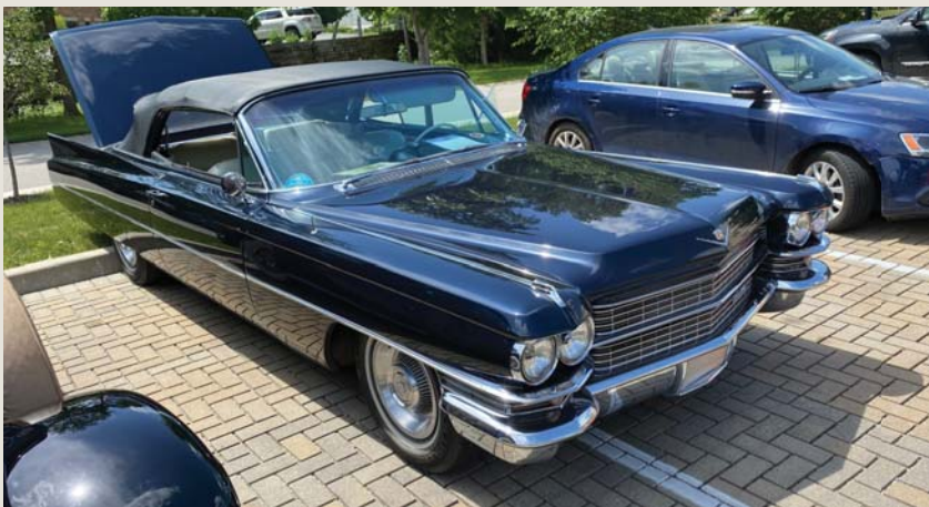
1963 Cadillac, Cliff Fiscus