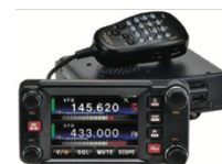
FTM-400XD 2M/440 Mobile