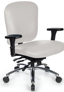
Everest For plus size Capacity 500 lbs EV-H-B-SS-96G-SW