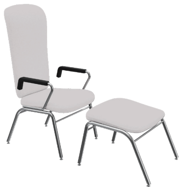
Ergo-medic Adjustable backrest EC-H-4-75C (armchair) EC-O-4-C (Ottoman)