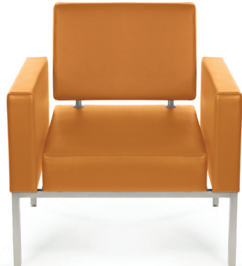
Mars 1.0 Optional sealed stitches 2 and 3 seats available MH1-SG