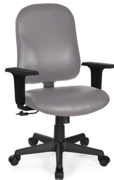
Top Multiple adjustments TP-H-T-01L-SW