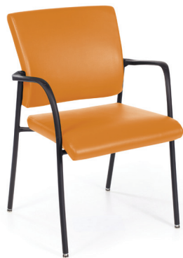
Finesse Bariatric optional Capacity 500 lbs FI-4-50BL-SX