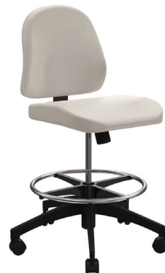
Desire Upholstered seat + backrest DR-L-200-SW