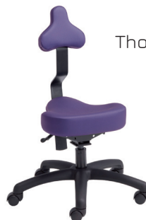
Med Thoracic support HS-200-SW SD-200-SW