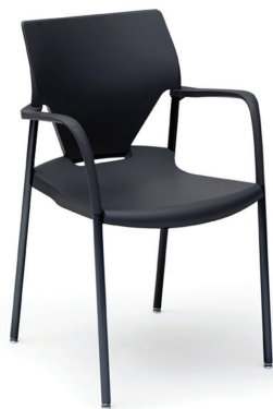
Arriva Black, dark gray or white stackable AV-4-50BL-SX