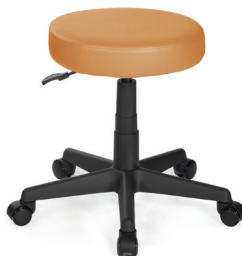
Lab Upholstered seat TB-O-120-SW