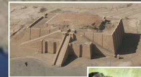
Zaggurat of Ur present day

The Work of the Atonement of the Son by the Father comes with a Land Covenant, that of the 'Palestinian' one. It comes the Greater Israel that is yet to be realized. It will only occur during the 1000-Year Kingdom of the Messiah when Jesus returns. The Physical Geo-Political Boundaries of the Borders of Greater Israel will be given to the Descendants of Abraham by way of Isaac, not Ishmael. The Spiritual 'Land' or Inheritance, that to include the whole Earth will be given to the Gentiles through Jesus Christ.