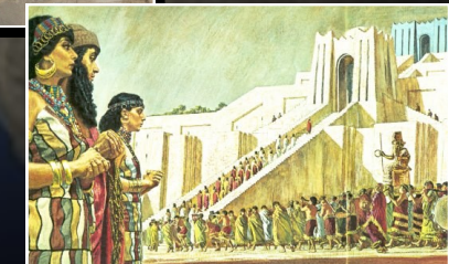
Abram came from a Priestly Family

As the Father is to present a Bride to Christ, so too Abraham sought a Bride for Isaac. As Rebecca was 'fetched' and taken out of her land, is the 'Year' of that Presentation to Isaac, the 'Son' then tied to the 1948 Benchmark Year of 2018? Abraham's Birth then foreshadowed the Re-Birth of Israel in so doing puts the 'Blessed Hope' or Rapture in-queue to take place in the Generation that saw the 1948 AD Re-Birth of Israel as the Rapture is a presentation of the Bride to the SON, the King. The Time-Frame is possibly within the 70-Year Generation of suffering to be completed by Israel. The 70th Year Anniversary since 2018 is added 1 Sabbath of Years. Thus 2018 + 7 Years = 2025. Will this Year start the 7 Year Tribulation Period? Nonetheless, Christians, now as Abraham are also looking to the New Jerusalem, with Foundations, whose Architect and Builder is YHVH.