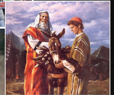
IF Abraham was indeed born in -1948 BC then some simple MATH can be asserted to come up with a unique Date from this Reference Point.