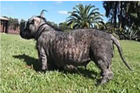
Lacy (October 2014)