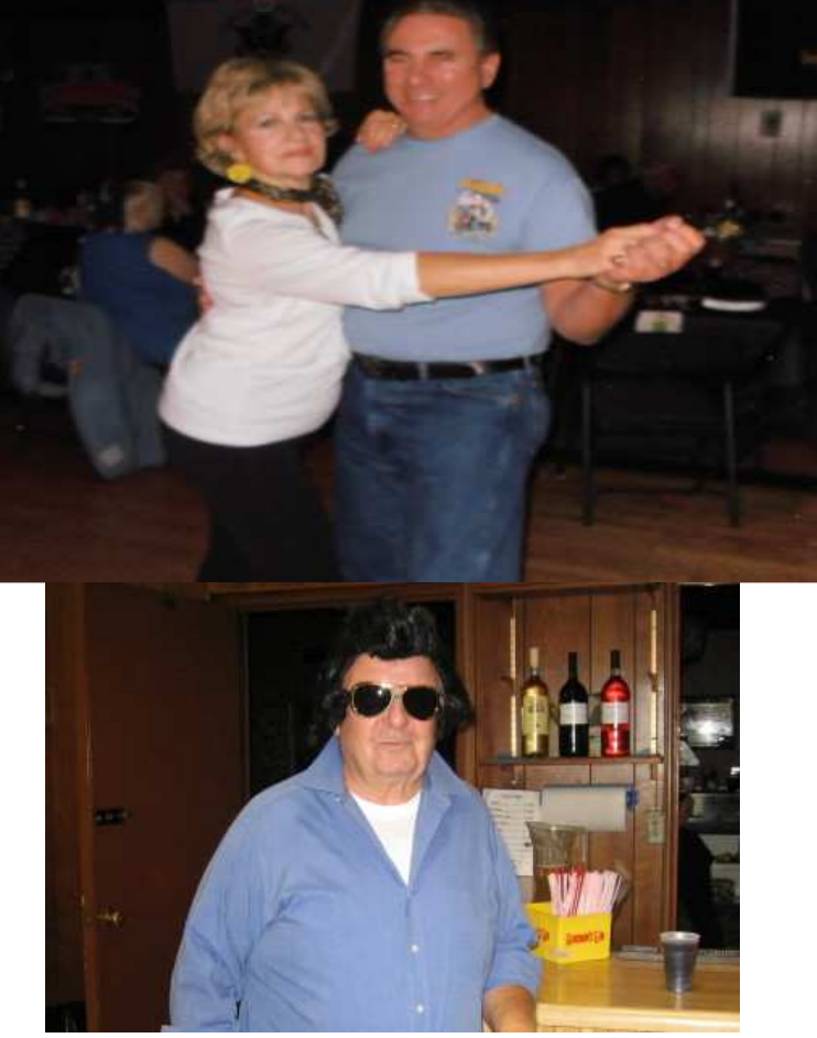
Another Elvis sighting