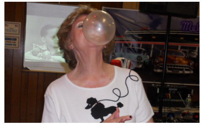
How's that for an amateur?

For more shows go to http://holtononline.com/carshows.html www.newjerseycarshows.com (reactivated)