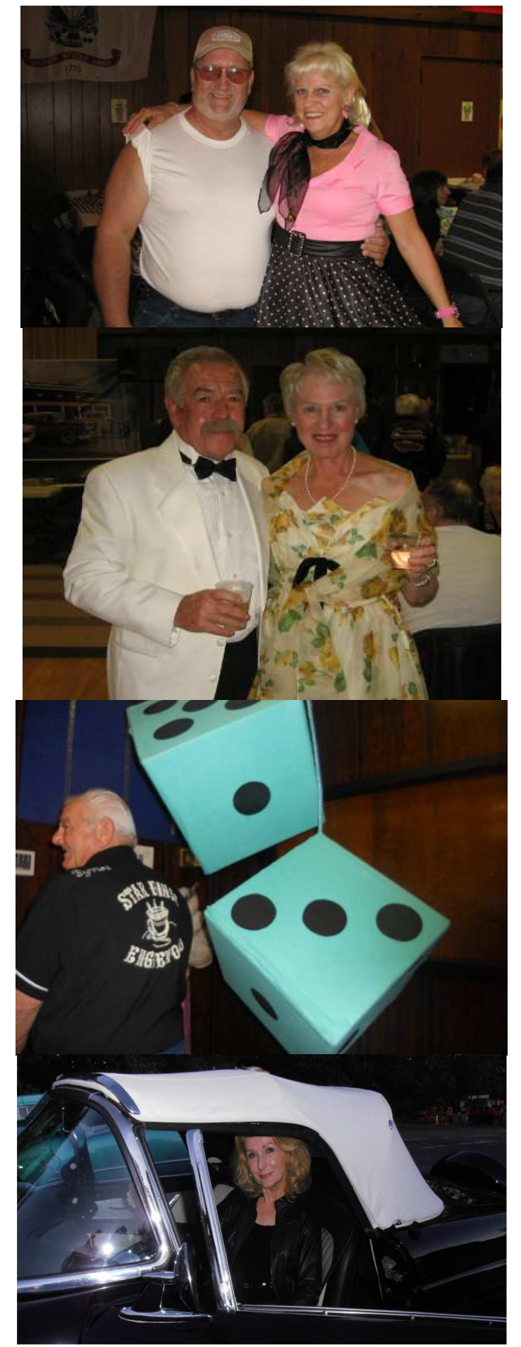
What's better than a 50's car at a 50's dance